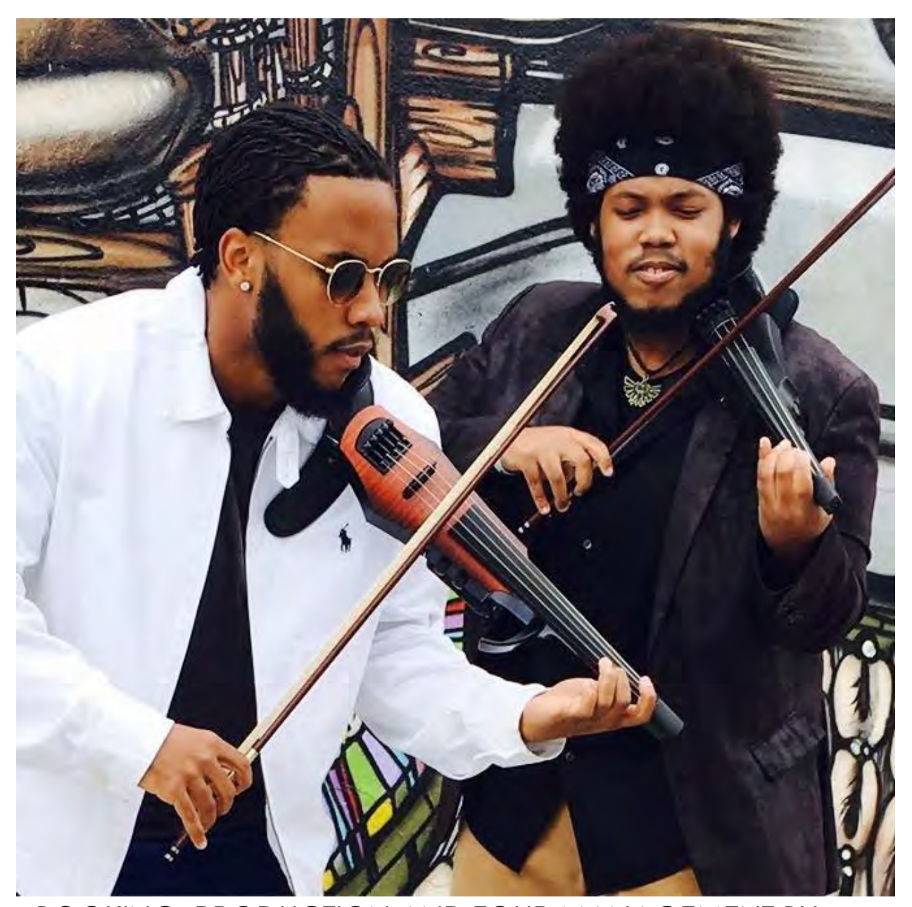
BOOKING, PRODUCTION AND TOUR MANAGEMENT BY: